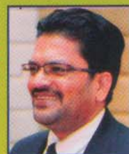
FACE TO FACE

Look for over 300 NEW PRODUCTS on Pages 49 - 70